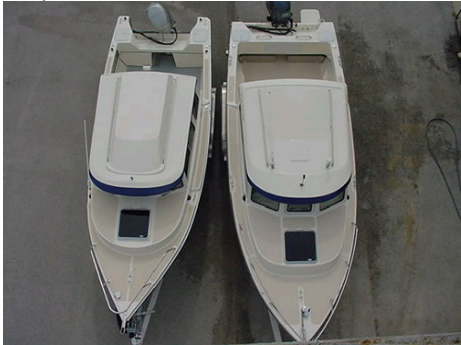
The Cape Cruiser (right) has a load bearing roof with non-skid area and a built in radome pad.