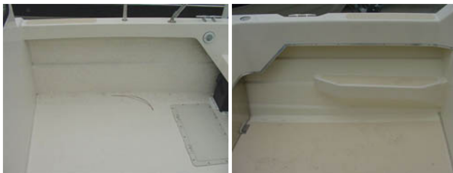
25' C-Dory / 26' Marinaut