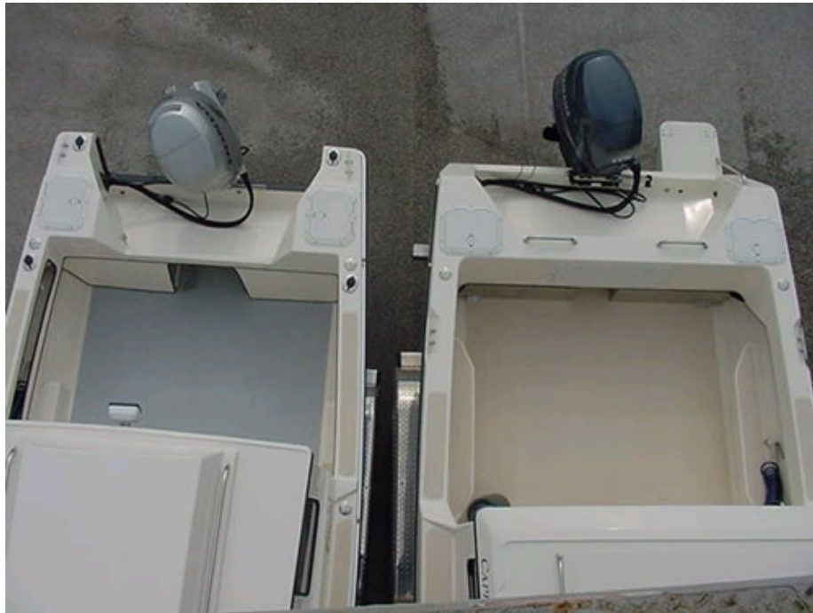
The Cape Cruiser (right) has a more spacious cockpit area with larger steps, fuel tanks and a rear draining deck