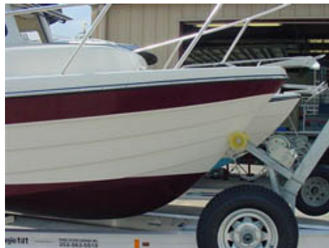
25' C-Dory / 26' Marinaut