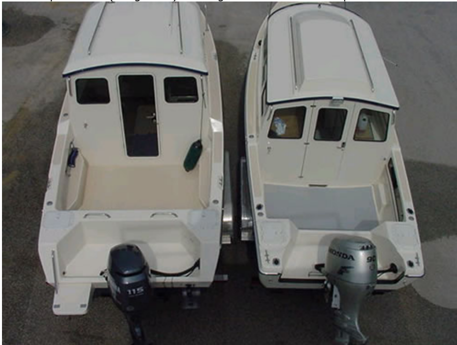
The Cape Cruiser on the Left has a full height splash well, larger cockpit and flat floor.