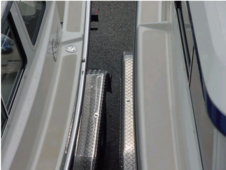
The Cape Cruiser (right) has a 7" gunnel width vs 5" on the C-Dory