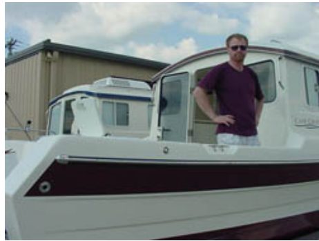
25' C-Dory / 26' Marinaut