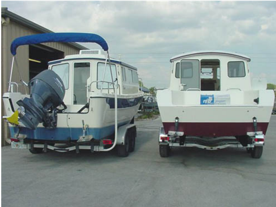
26' Marinaut [right] Full Height Splashwell