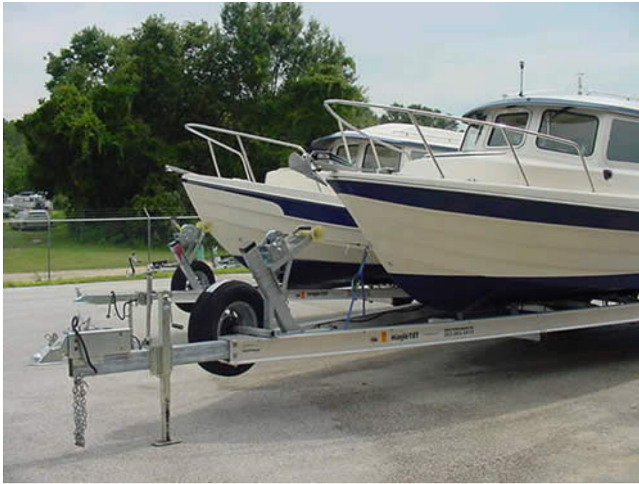
Note: Cape Cruiser (foreground) has larger bow rail and four lap lines