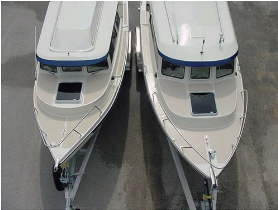
The Cape Cruiser has a broader bow width and full bow rail.