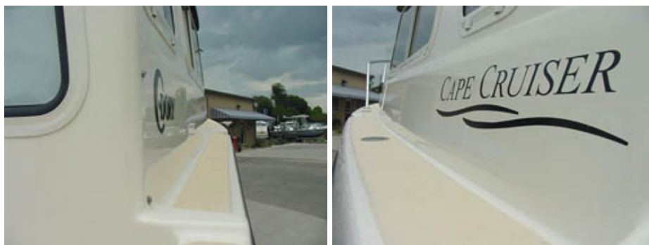
25' C-Dory / 26' Marinaut

Phone: (352) 563-5510 / Toll Free: 1-800-668-5510 / Fax: (352) 563-5819 Questions? or Comments! send e-mail to: sales@threeriversmarineinc.com Copyright © 2005 Three Rivers Marine Inc. All Rights Reserved.