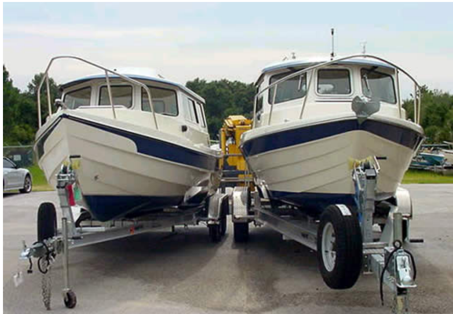
22' C-Dory on the left. 23' Cape Cruiser on the right