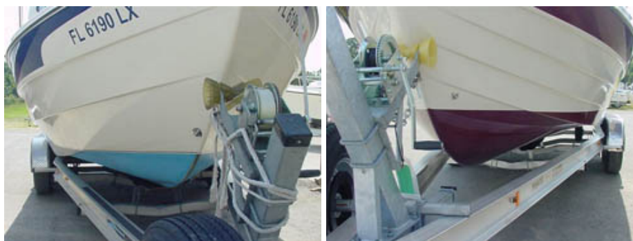
25' C-Dory / 26' Marinaut